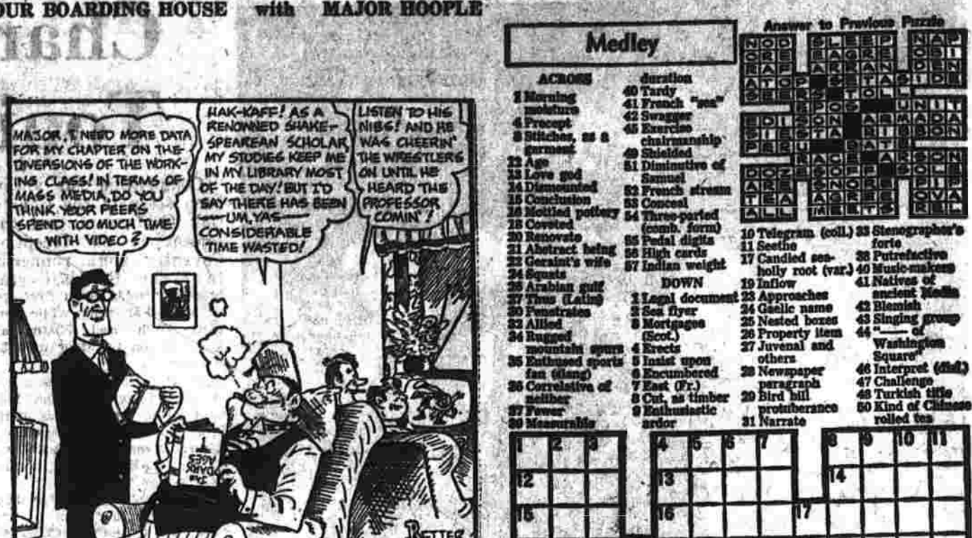
MEDLEY BY DICK TURNER