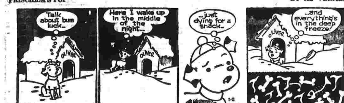
FRISILLA'S POP BY AL VERMEER