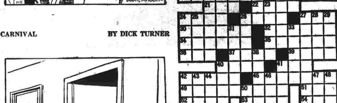
CARNIVAL BY DICK TURNER