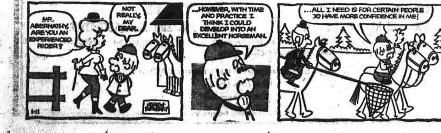
MICKY FINN BY LANK LEONARD