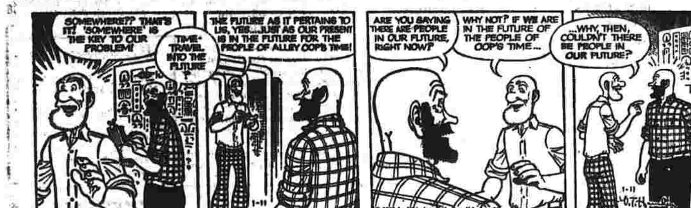
ALLY OOP BY V. T. HAMLIN