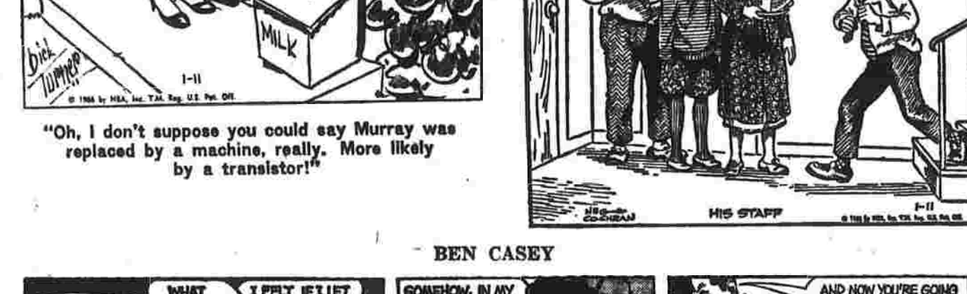
BEN CASEY BY BEN CASEY