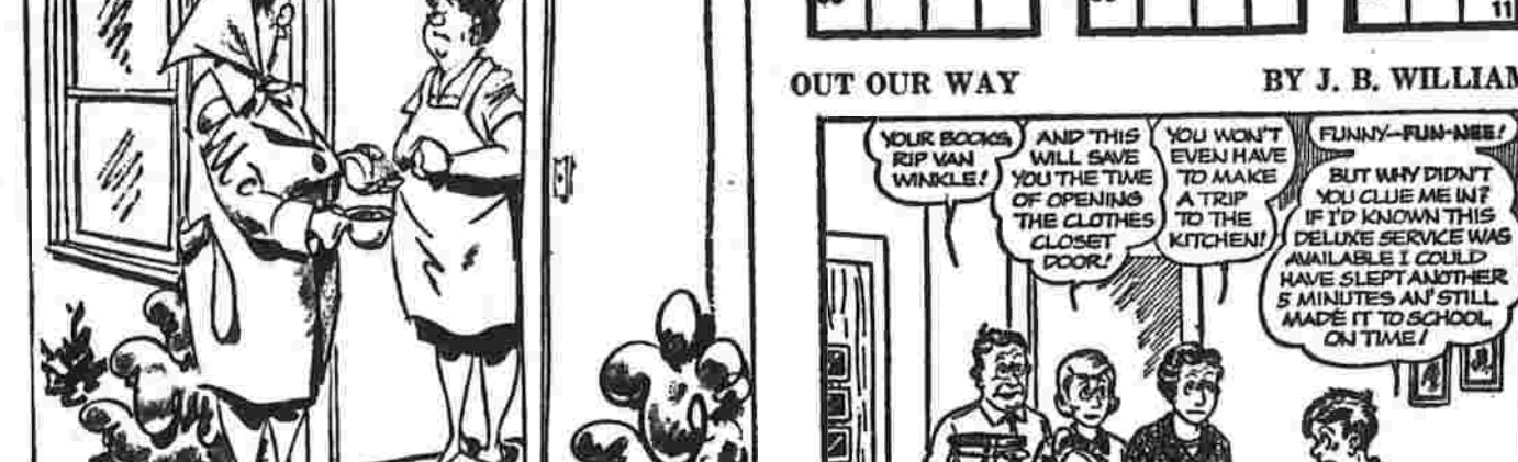
OUT OUR WAY BY J. B. WILLIAMS